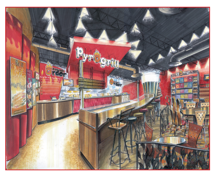
King-Casey developed a range of restaurant design concepts that reflected the new brand positioning and identity. These color renderings are used to guide the design development process and the eventual build-out of the new concepts.